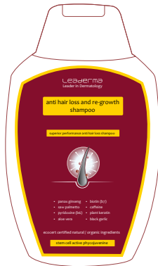
clinical shampoo 300ml e 10.2 fl oz