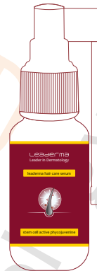
clinical serum 33ml e 10.2 fl oz